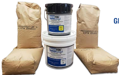
4 BAG GROUT CONVENTIONAL SYSTEM