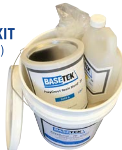
GROUT EZ KIT (ALL IN ONE)