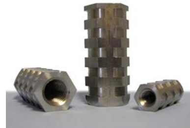
FIELD INSTALLED THREADED INSERT KITS