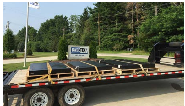
Quick Turnaround/Delivered to Jobsite