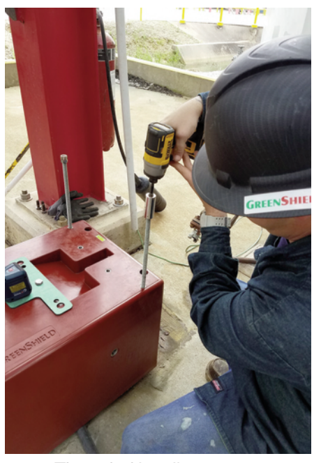
Threaded leveling screws with PoxyVials™