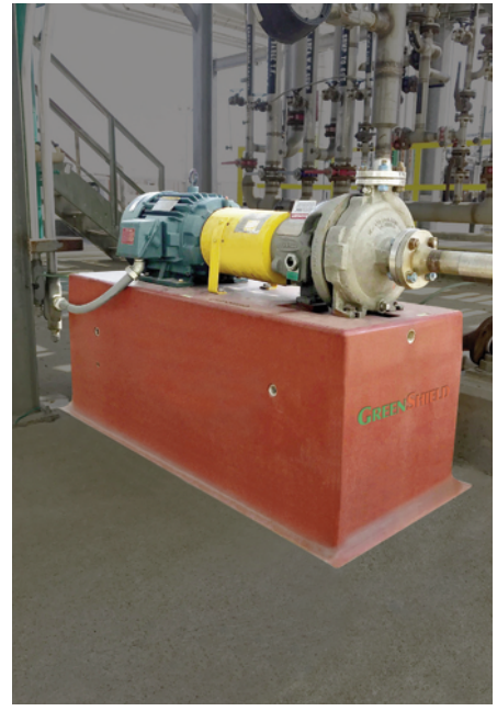
Surface Mount with PoxyCove